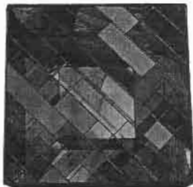
"Tesseract View of HyperCube III"

Any more mathematical sculptors or modelers out there? —I.S.